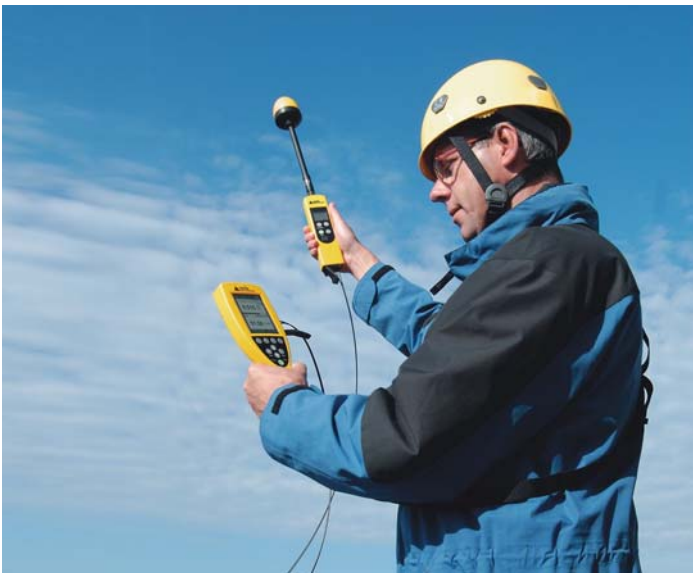
Probe extension using an optical cable: The NBM-550 acts as controller and displays the results. The smaller NBM-520 acts as the optical probe interface. Both devices can also be used separately as measuring devices when fitted with probes.