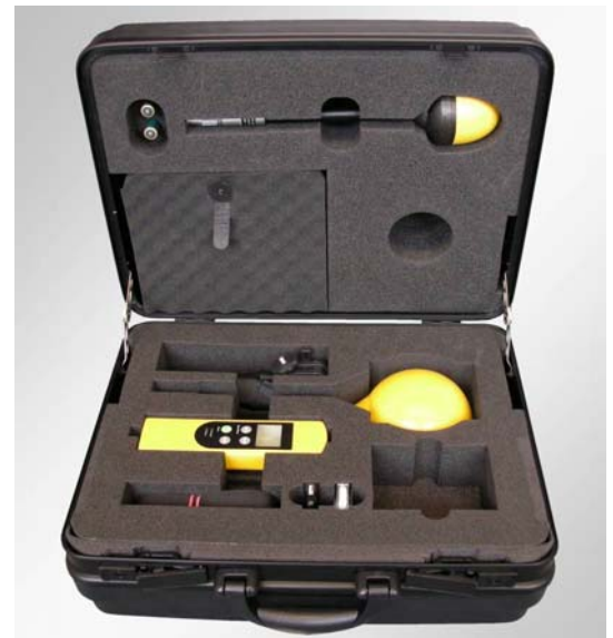
A rugged transport case is included. This provides ideal protection for the instrument, together with up to two probes and all accessories.