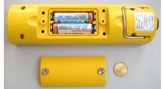
The battery compartment is opened easily using a coin. Two replaceable NiMH rechargeable batteries (AA size) are used to power the device.