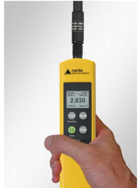
Small, lightweight and rugged design – ideal for use in rough environments