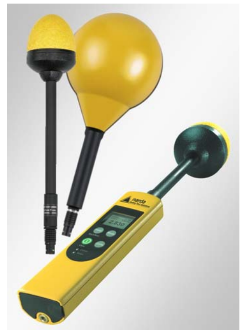
Changing the probe is quick and easy, with no need to reconfigure the device