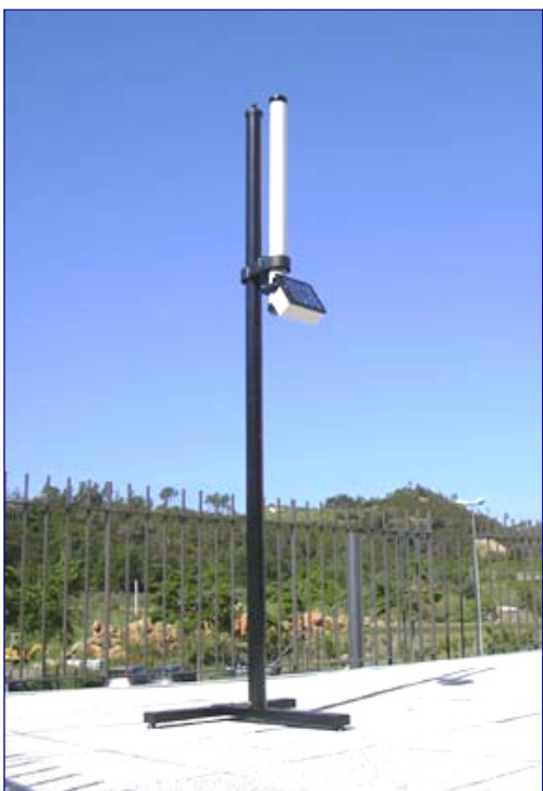
Area Monitor with solar panel

Remote control: The PC Software allows programming all parameters and to upload on PC the data stored in the 8057 Area Monitor. Data can be displayed as graphics or tables, and exported in standard ASCII format.