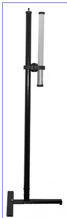
With Li-Ion disposable battery