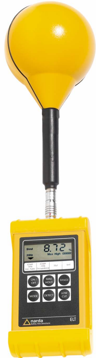
Exposure Level Tester ELT-400